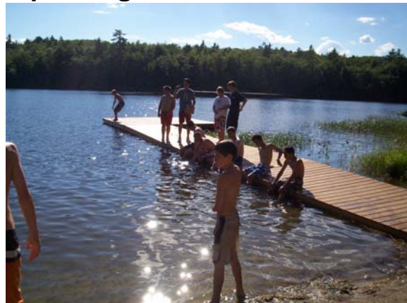
The shallow depth of Birch Pond means the water temperature is warm and comfortable all summer long.