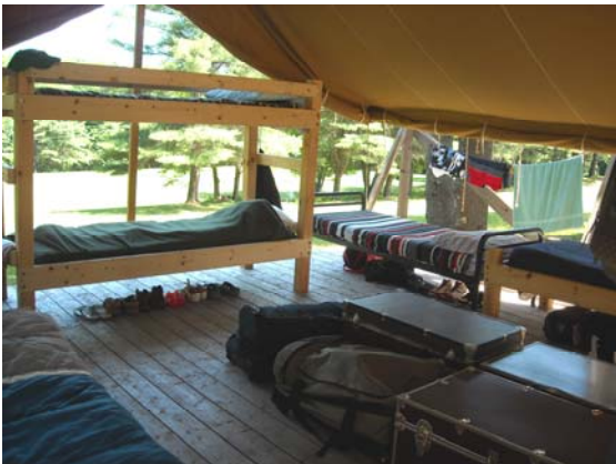
Camper compete for "cleanest" tent and chance to win a Netop Sundae. Look at those shoes!